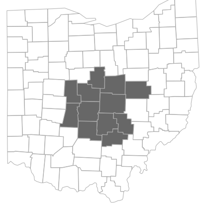
THE COTC ENROLLMENT AREA, OHIO